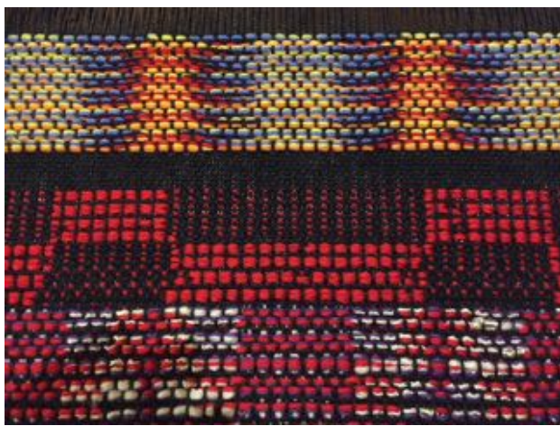
Sample of polychrome weave from the workshop